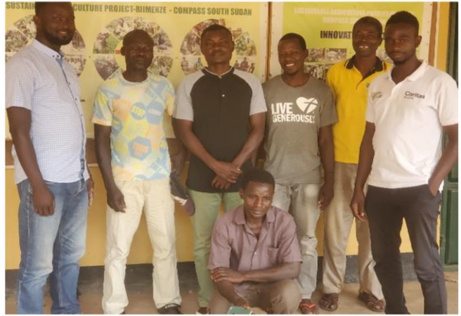
Group photo of CEWs

In February 2025, Community Extension Workers (CEWs) attended a three-day introduction training on horticulture and livestock management. In addition, they were trained on monitoring tools in preparation for the quarterly data collection for the Sustainable Brick Production and Energy-Efficient Cooking for Vulnerable Households in South Sudan (SPEEC) project.