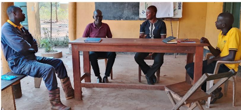
Working with the finance officer

On 7 February, a financial officer from the Solidarity office in Juba paid an official visit to the SAP-R farm, where he had the opportunity to interact with project staff and evaluate financial documentation. The official also advised and directed project staff on best practices in recording and documentation. Suggestions welcomed by the project staff.