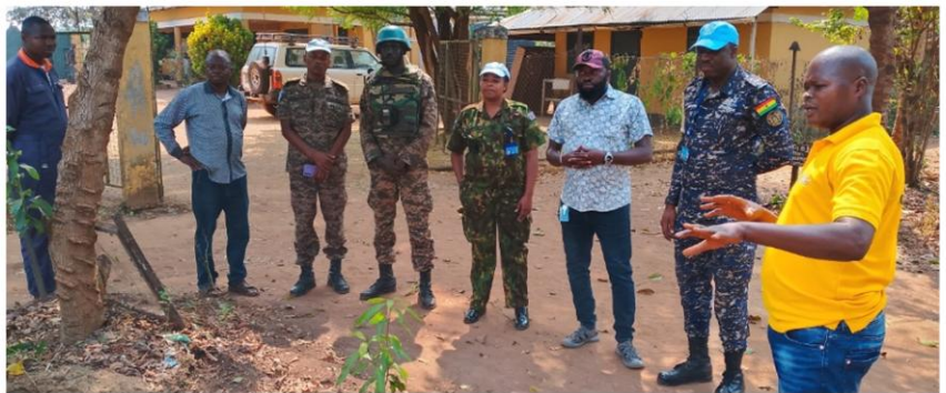
The UNMISS team visiting the farm

The visitors were taken to the various sections of the farm, and the project activities were explained to them. The peace keepers applauded the initiative, stating that sustainable agriculture is the only way to go. They finally assured Solidarity of their constant patrolling of the area.